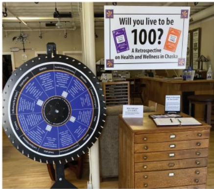
Exhibit opens Thursday June 8, 6:30 p.m.

A Retrospective on Health and Wellness in Chaska